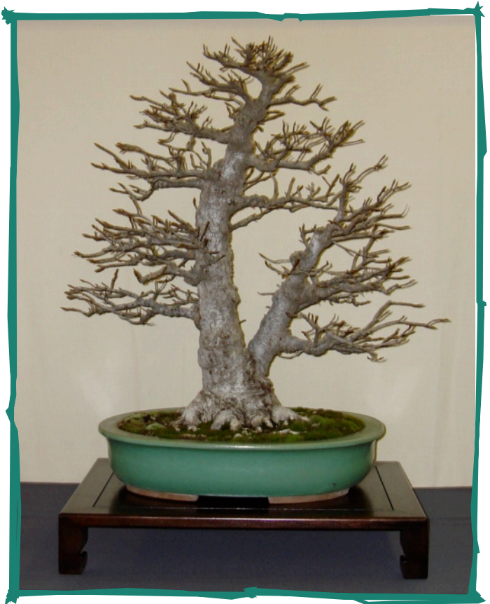
Winter Sillhouettes 2010 Marge Blasingame, Oriental Liquidambar

If you haven't done so, get your soil mix prepared and stored. I use a trash can with a tight lid.